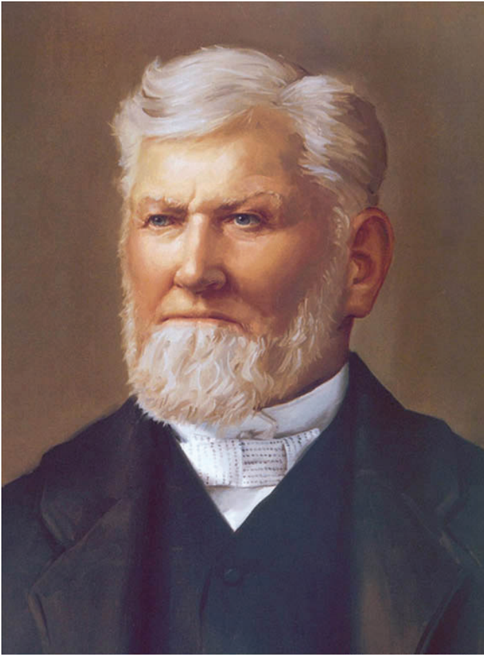
Wilford Woodruff 4th President of the Church 1889-1898