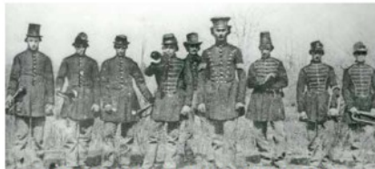
JOHNSTON'S ARMY, CAMP FLOYD

Follow link to: 2024 National Encampment