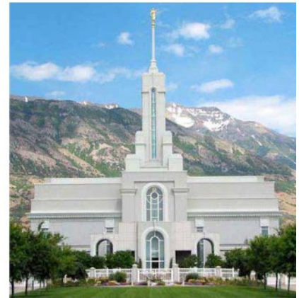
MOUNT TIMPANOGOS TEMPLE

SPONSORED BY: BRIGHAM YOUNG CHAPTER LEHI CHAPTER MAPLE MOUNTAIN CHAPTER SQUAW PEAK CHAPTER TIMPANOGOS CHAPTER